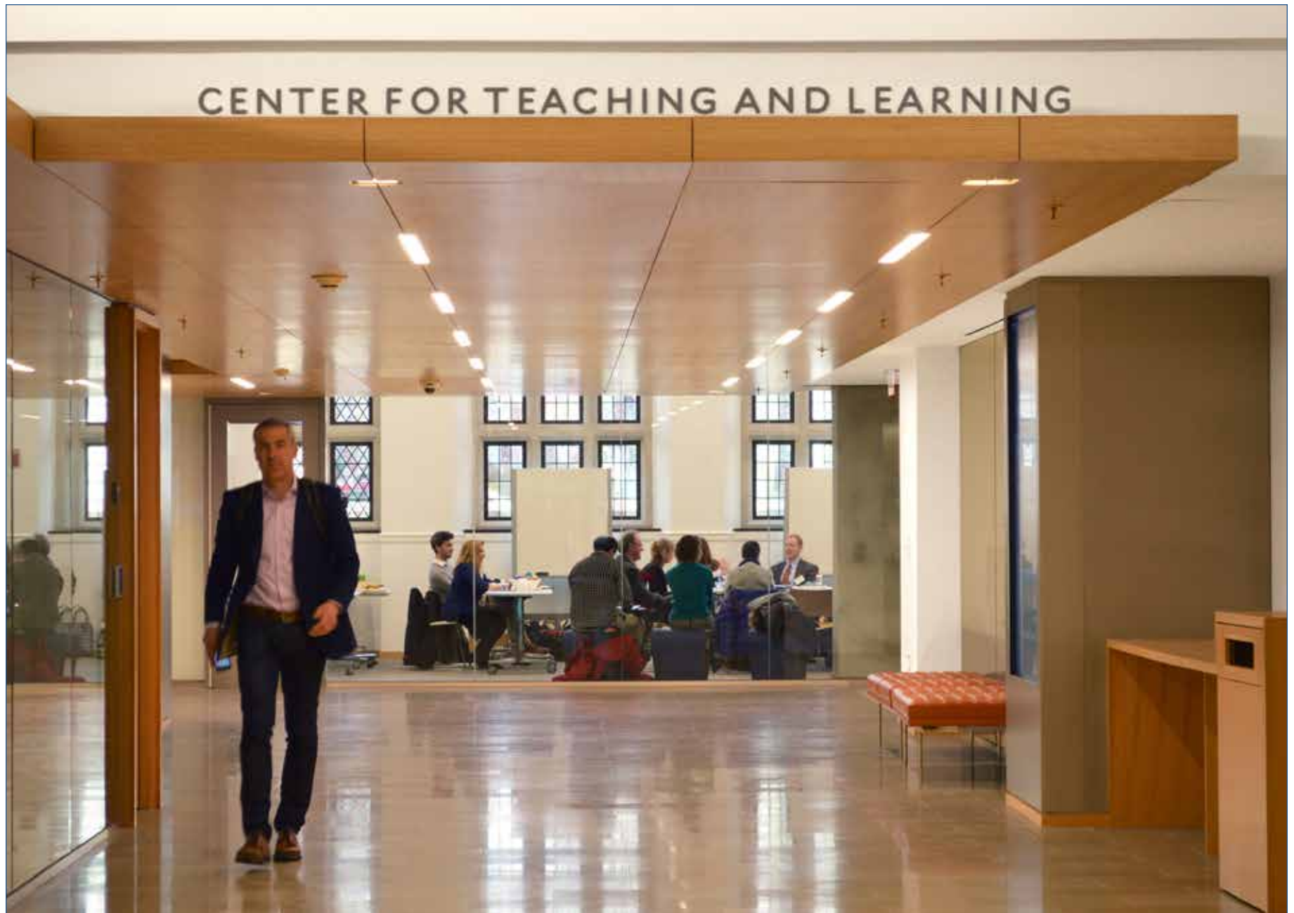
The CTL can also be accessed from the Sterling Memorial Library's nave via a new and welcoming passageway, which also creates a direct route between Cross Campus and York Street.