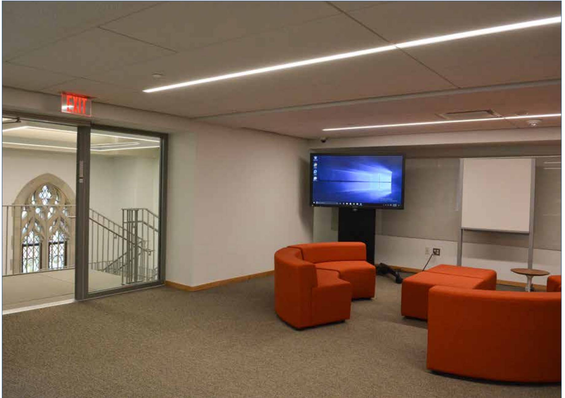
The mezzanine level is home to touchdown space, a suite of rooms dedicated to writing tutoring, and a classroom.