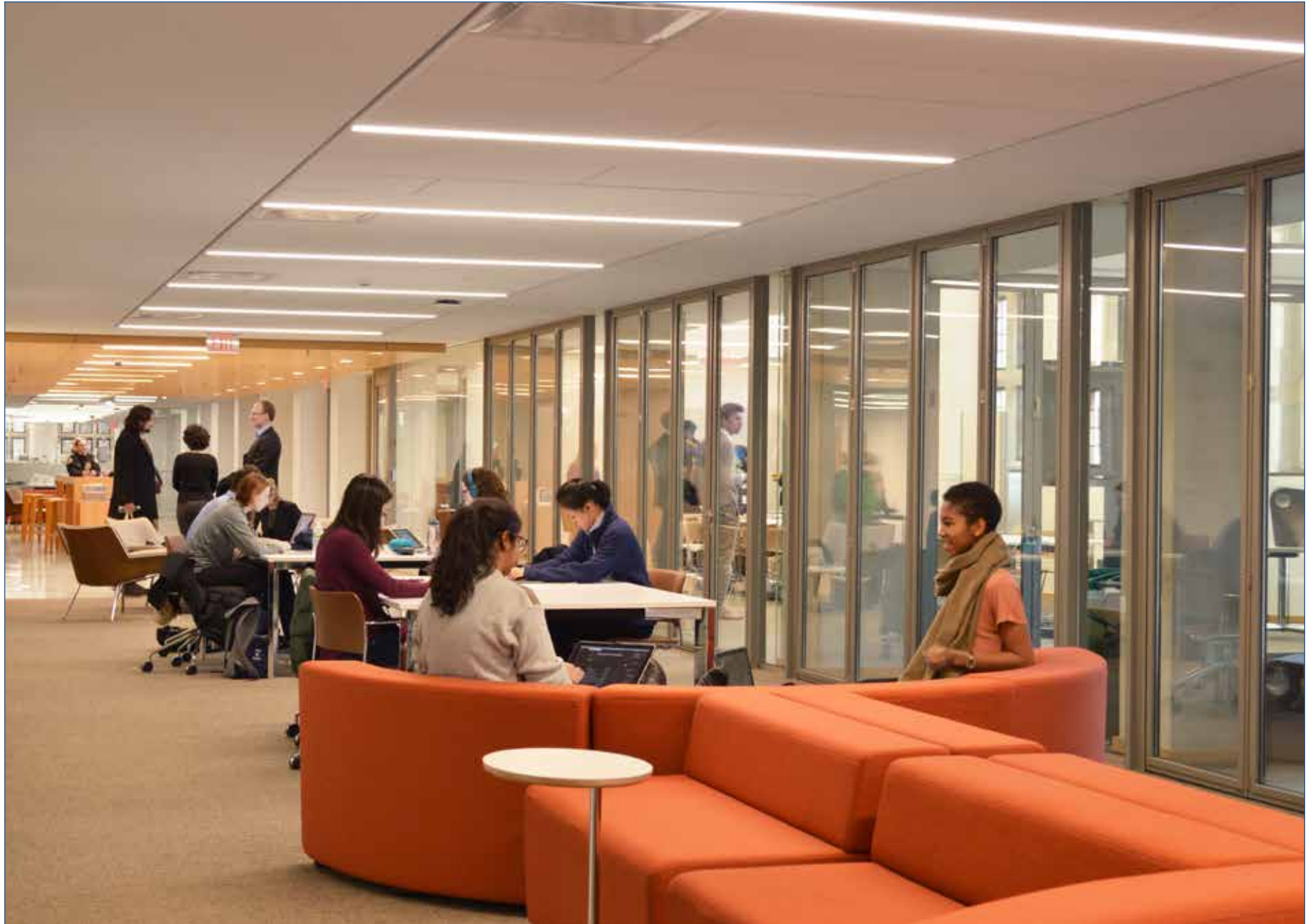
Modular furniture, like these orange couches, can be rearranged by staff and students as needed to accommodate groups of varying sizes.