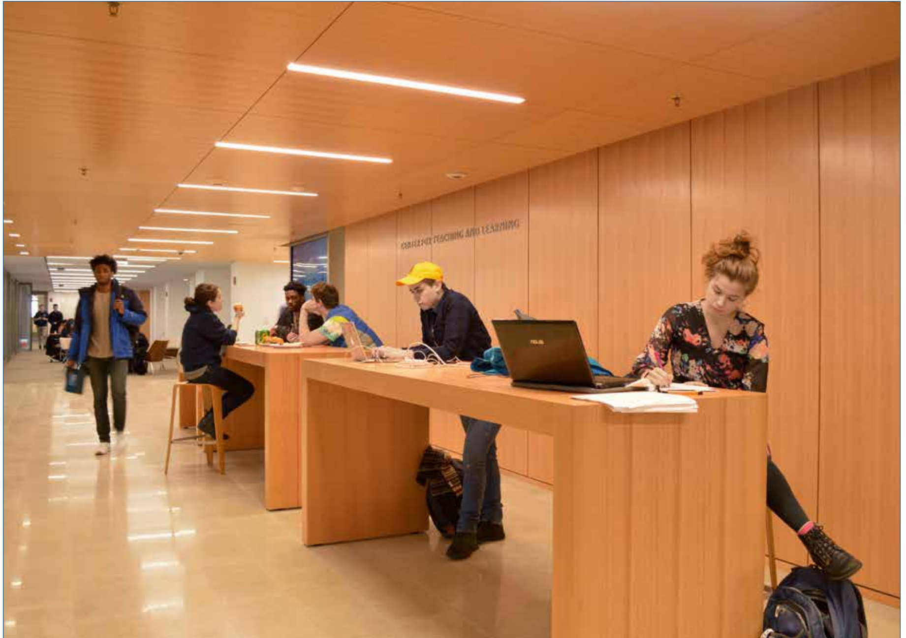
Entering the CTL from York Street, visitors encounter a welcome desk and common work areas, referred to as touchdown spaces, designed for casual group work and gatherings.