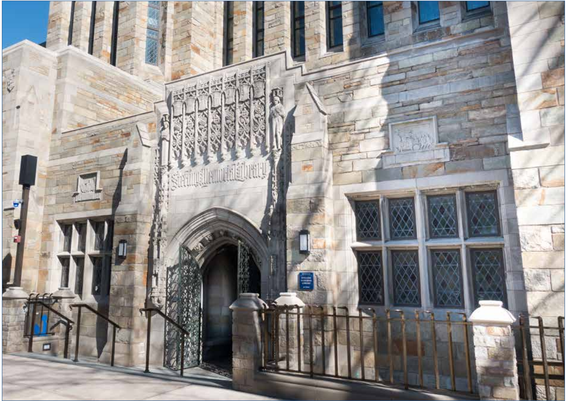
With the creation of the Center for Teaching and Learning, a long-shuttered York Street entrance to Sterling Memorial Library was reopened.