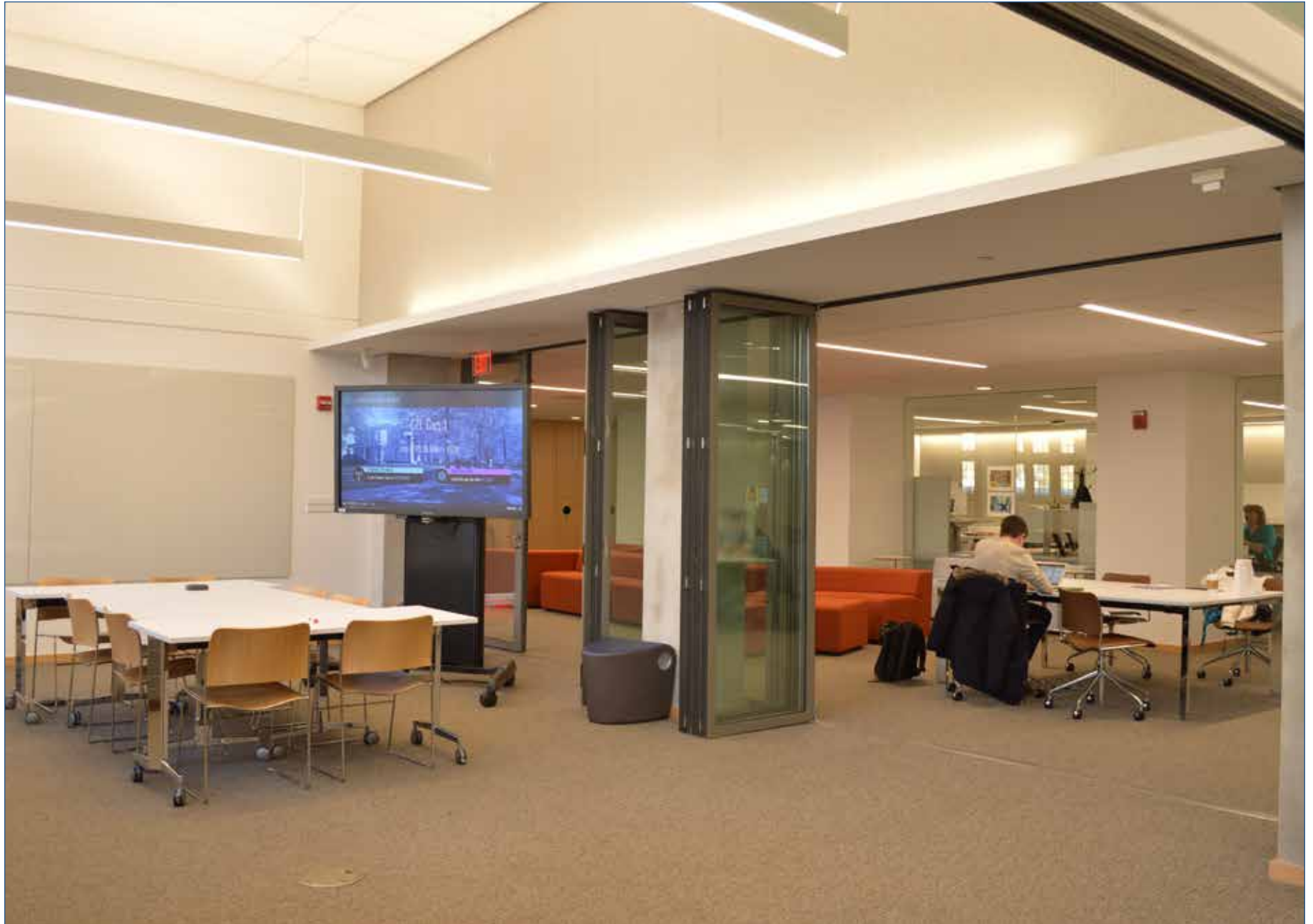
Retractable walls in two classrooms can be closed to create discrete areas for teaching or left open to form an open space connecting to the main learning commons.