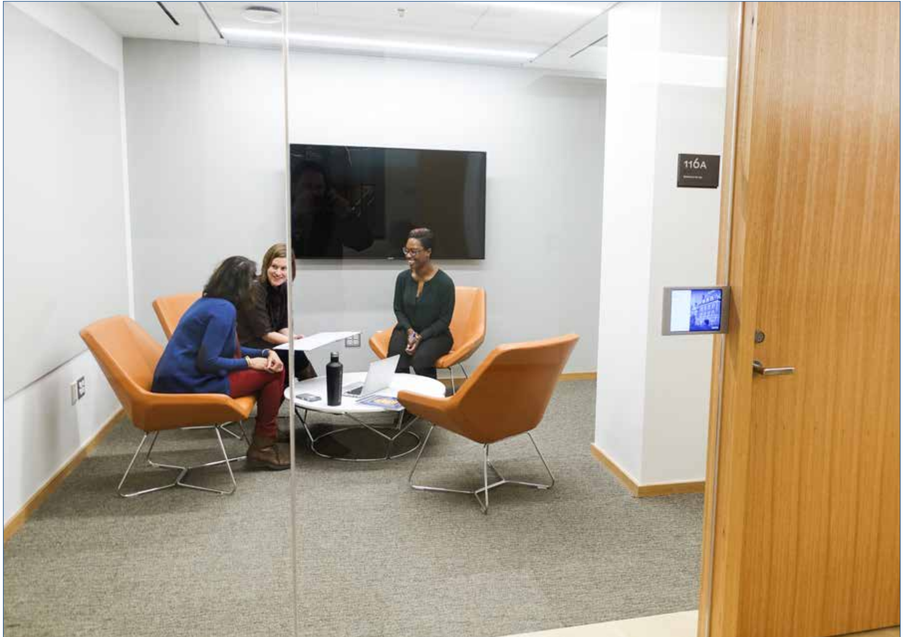
Collaboration rooms are designed to foster teamwork and provide dedicated spaces for CTL staff to meet with instructors and students. An electronic reservation system makes it easy to reserve a room.