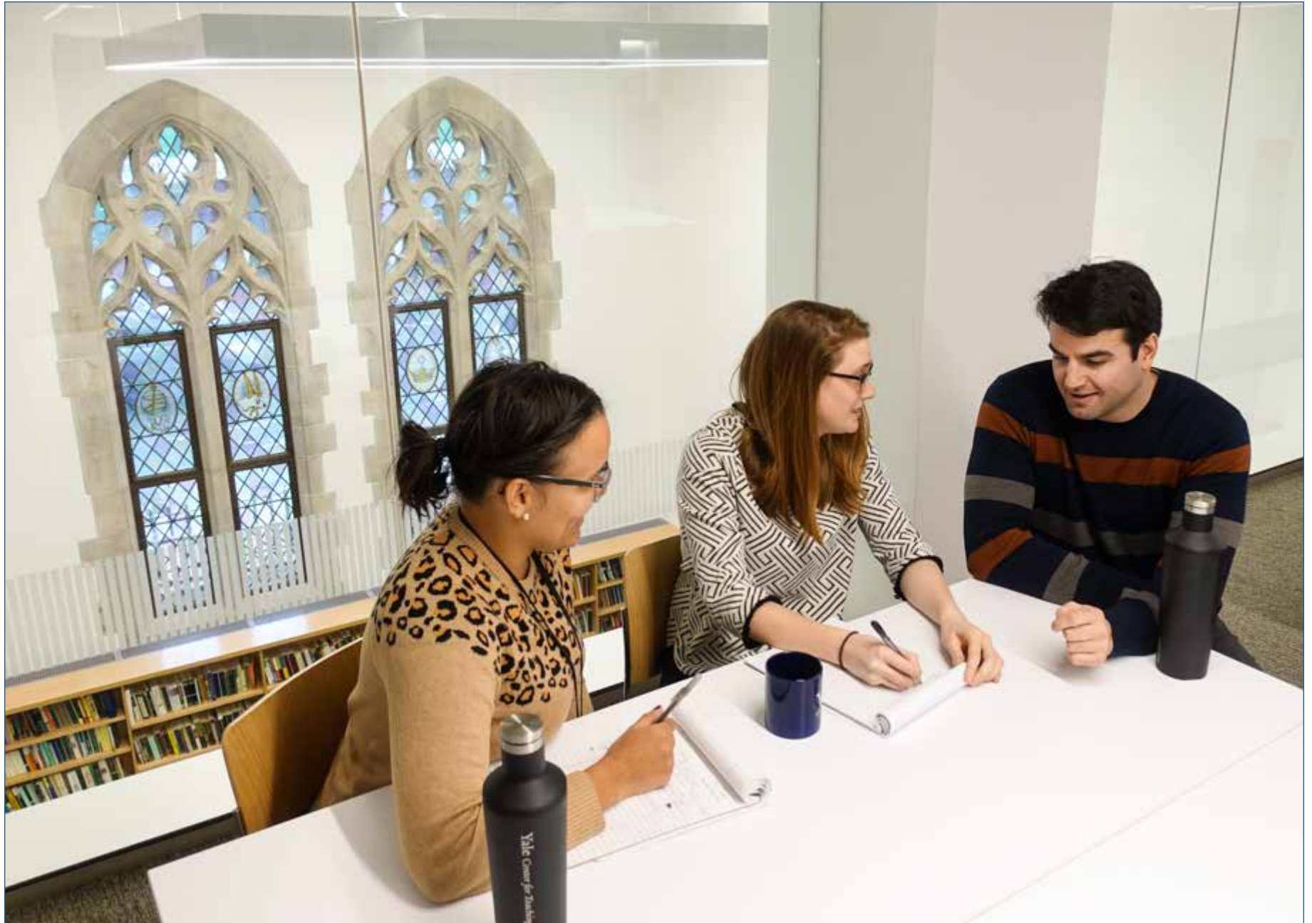
Like all teaching spaces in the CTL, the mezzanine classroom has modular furniture and writable glass walls.