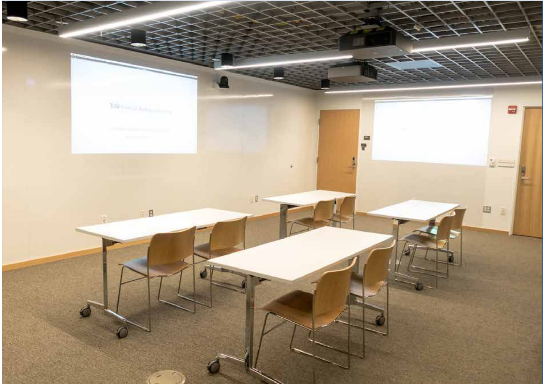
The studio suite features a room designed for instructors to practice presentations. Ceiling-mounted cameras can record lectures for later review and analysis.