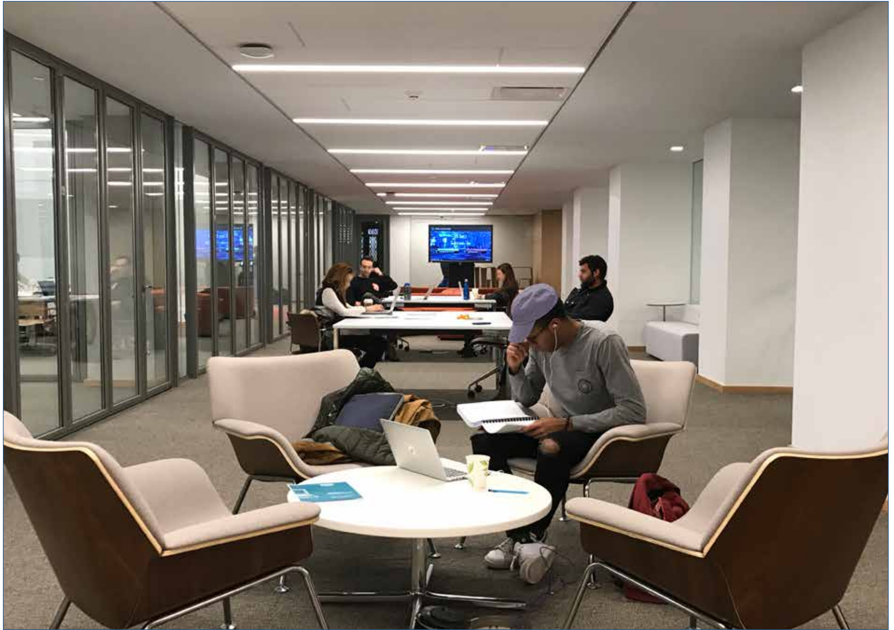
The learning commons is a hub of activity and the heart of the CTL. Students and faculty gather here to study, collaborate, and socialize.